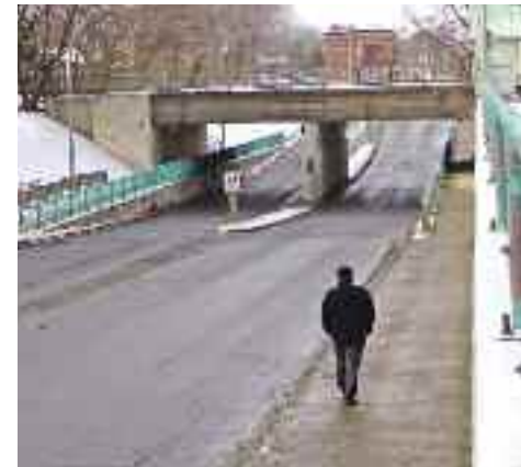
As seen here on February 11, the Westminster underpass will get a facelift this summer.